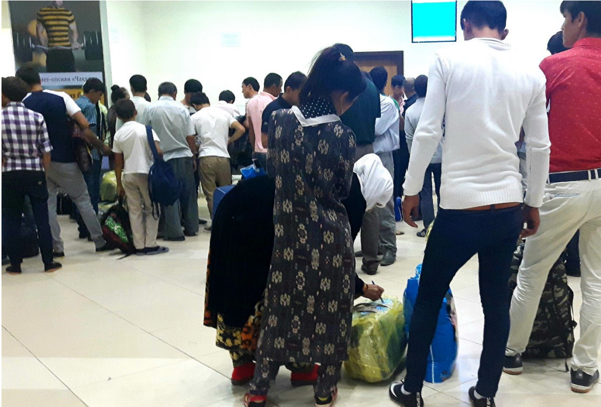
Picture 1: Relatives accompanying young men to the airport before their trip to Russia